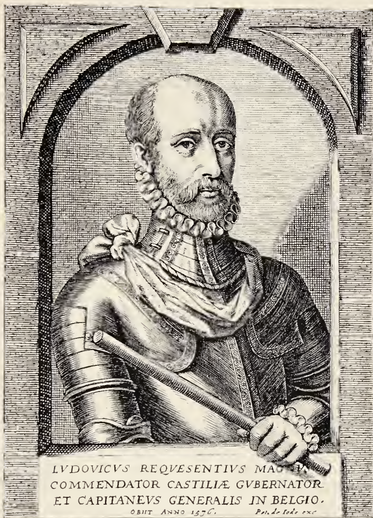
DON LUIS DE REQUESENS. After a contemporaneous print.